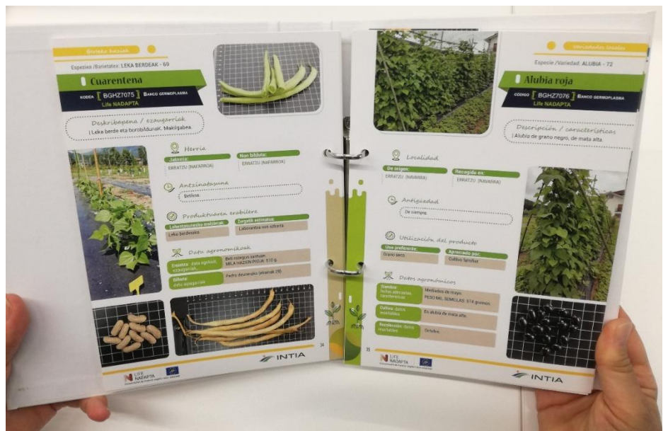
Figure 2: The guide to local horticultural varieties of Navarre, in its paper version.

As climate change intensifies agricultural challenges, experts have renewed their interest in these ancient seeds, which are well adapted to their local environments and have demonstrated long-term resistance to diseases and extreme weather. Within this context, a core focus of the LIFE-IP NAdapta-CC project has been the recovery of ancient and local horticultural varieties maintained by farmers across Navarre. Thanks to the work of INTIA and the generous collaboration of many farmers and individuals, nearly one hundred horticultural varieties have been recovered.