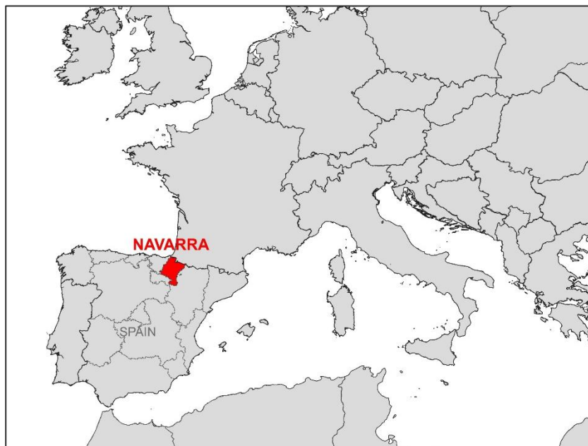
Figure 1: Location of the Navarre region within Spain and Europe.

Ecosystem and Nature-based Solutions, Land use and Food systems, Local Economic System