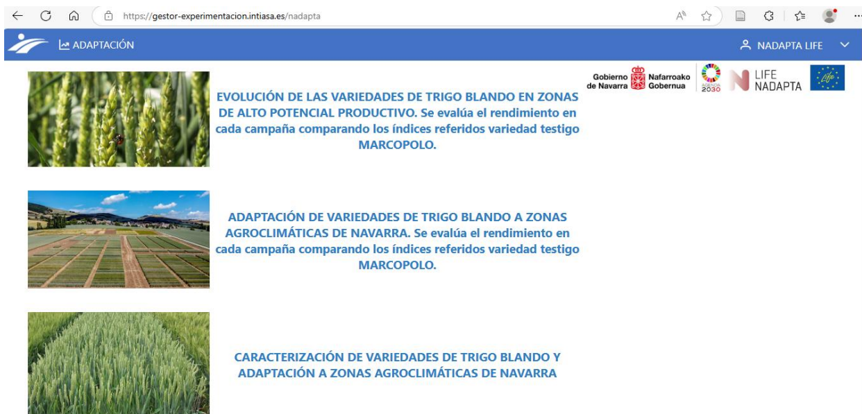
Figure 4: A screenshot from the GEXPER platform.

Several newspaper articles, special report recordings and interviews over the years reflect great media attention about the preservation work and its progress. In recent years, INTIA has continuously received collaboration offers from individuals who have been preserving various seed species for decades, which has allowed it to inform and expand the recovery catalogue. The “Libraries and Seeds” (“ Bibliotecas y semillas. Liburutegiak eta haziak ”) project of the Public Libraries Network of Navarre collaborates with the Seed Network of Navarre . To date, the seed lending service has incorporated almost fifty local horticultural varieties recovered in recent years. This service enables the public to use and reproduce these varieties in urban and rural gardens, thus contributing to the preservation of agricultural biodiversity and encouraging community participation. The success of the initiative is linked to the high level of citizen collaboration, the number of local seeds collected, and the subsequent communication, dissemination, and knowledge transfer.